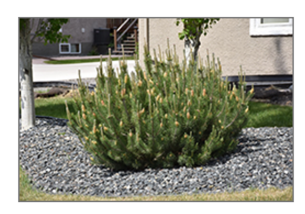
Mugo Pine

An extremely hardy and adaptable evergreen, this is actually a highly variable species, almost no two are alike, ranging from small garden detail shrubs to tall, wide trees; many specific cultivars are available, needs full sun