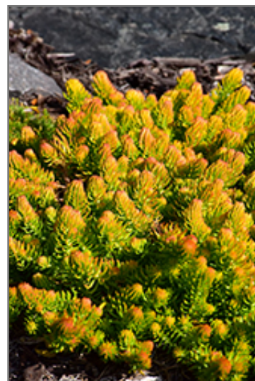
Angelina Stonecrop foliage

Angelina Stonecrop is recommended for the following landscape applications;