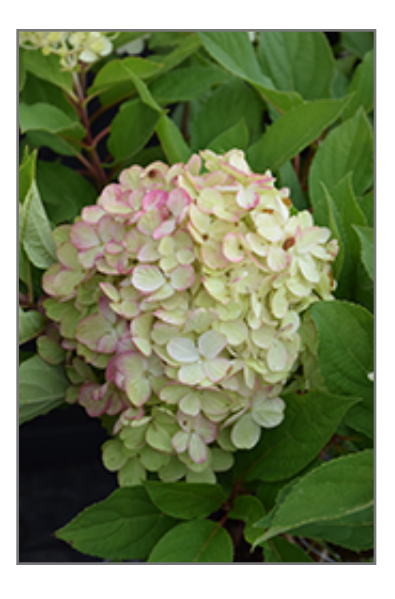
Fire Light Tidbit Hydrangea flowers