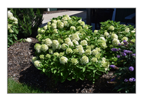
Fire Light Tidbit Hydrangea in bloom

This shrub performs well in both full sun and full shade. It prefers to grow in average to moist conditions, and shouldn't be allowed to dry out. It is not particular as to soil type or pH. It is highly tolerant of urban pollution and will even thrive in inner city environments, and will benefit from being planted in a relatively sheltered location. Consider applying a thick mulch around the root zone in both summer and winter to conserve soil moisture and protect it in exposed locations or colder microclimates. This is a selected variety of a species not originally from North America.