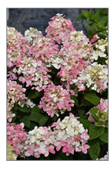
Fire Light Tidbit Hydrangea flowers (faded)

Fire Light Tidbit Hydrangea is recommended for the following landscape applications;