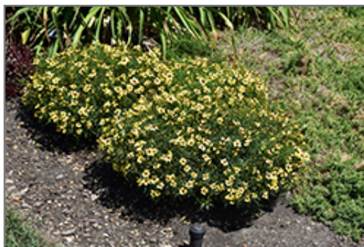
Sizzle And Spice Sassy Saffron Tickseed in bloom