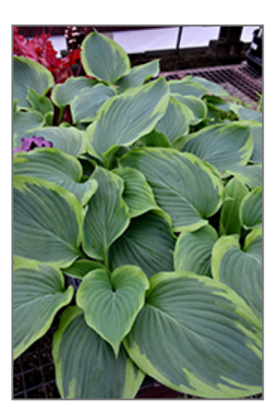
Shadowland Wu-La-La Hosta foliage