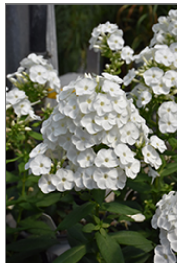
Luminary Backlight Garden Phlox flowers