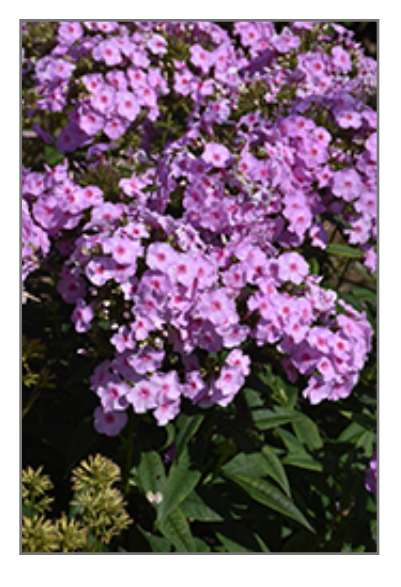
Luminary Opalescence Garden Phlox flowers

Luminary Opalescence Garden Phlox is a dense herbaceous perennial with an upright spreading habit of growth. Its medium texture blends into the garden, but can always be balanced by a couple of finer or coarser plants for an effective composition.