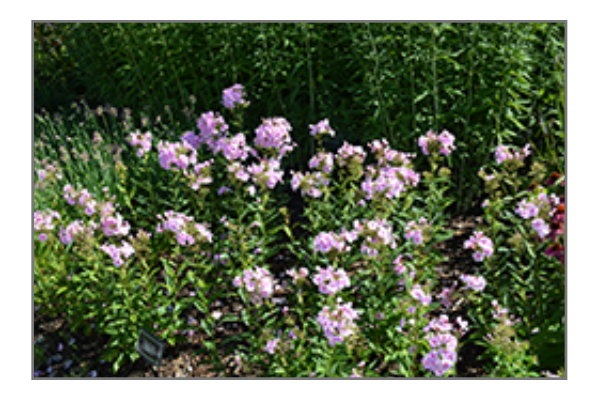
Luminary Opalescence Garden Phlox in bloom

This plant will require occasional maintenance and upkeep, and should be cut back in late fall in preparation for winter. It is a good choice for attracting butterflies and hummingbirds to your yard. Gardeners should be aware of the following characteristic(s) that may warrant special consideration;