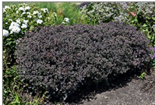
Night Light Stonecrop in bloom

This is a relatively low maintenance plant, and is best cleaned up in early spring before it resumes active growth for the season. It is a good choice for attracting butterflies to your yard, but is not particularly attractive to deer who tend to leave it alone in favor of tastier treats. It has no significant negative characteristics.