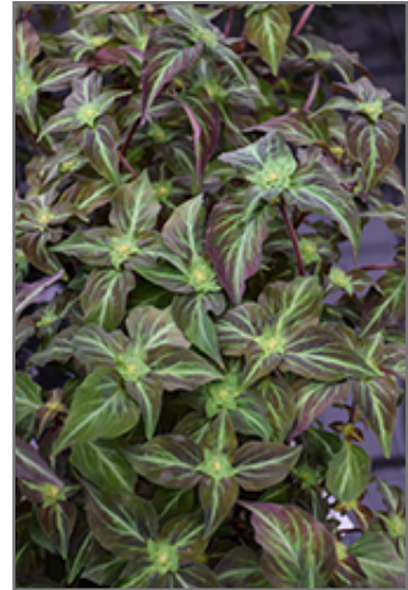
Night Light Moneywort foliage