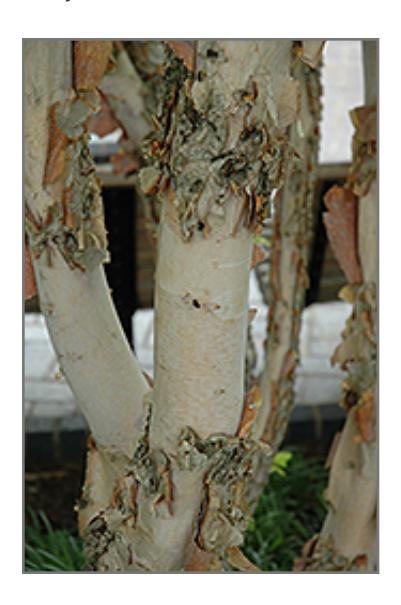
Fox Valley River Birch bark

Fox Valley River Birch is recommended for the following landscape applications;