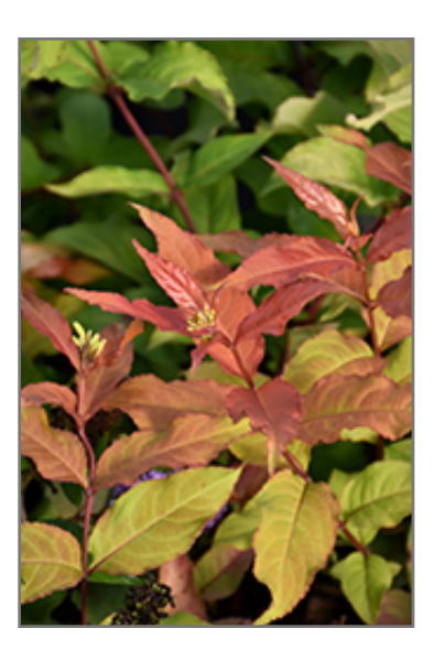
Kodiak Fresh Diervilla foliage

Kodiak Fresh Diervilla is a dense multi-stemmed deciduous shrub with a mounded form. Its average texture blends into the landscape, but can be balanced by one or two finer or coarser trees or shrubs for an effective composition.