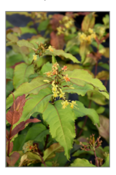
Kodiak Fresh Diervilla flowers