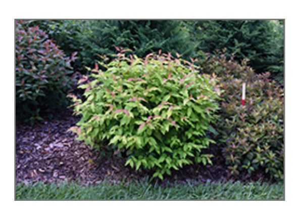
Kodiak Fresh Diervilla

Kodiak Fresh Diervilla makes a fine choice for the outdoor landscape, but it is also well-suited for use in outdoor pots and containers. Because of its height, it is often used as a 'thriller' in the 'spiller-thriller-filler' container combination; plant it near the center of the pot, surrounded by smaller plants and those that spill over the edges. It is even sizeable enough that it can be grown alone in a suitable container. Note that when grown in a container, it may not perform exactly as indicated on the tag - this is to be expected. Also note that when growing plants in outdoor containers and baskets, they may require more frequent waterings than they would in the yard or garden.