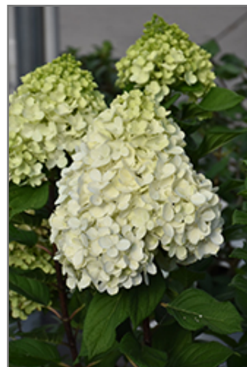
Little Lime Punch Hydrangea flowers

Little Lime Punch Hydrangea is recommended for the following landscape applications;