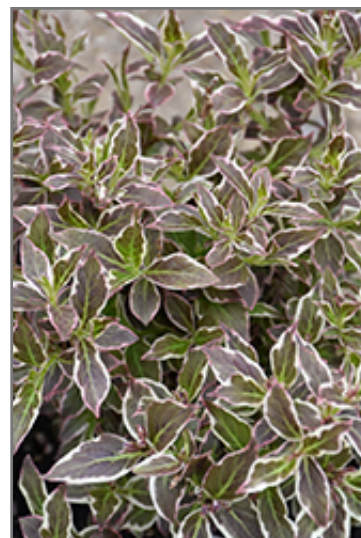
My Monet Purple Effect Weigela foliage