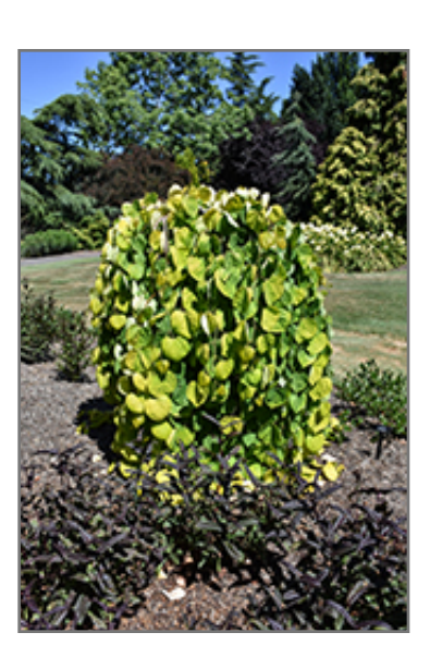
Golden Falls Redbud

A spectacular and hardy spring bloomer, with very showy pink flowers held tightly on bare branches in early spring; orange tinged, yellow emerging foliage matures to gold and lime green; a great weeping ornamental tree for specimen use in the landscape