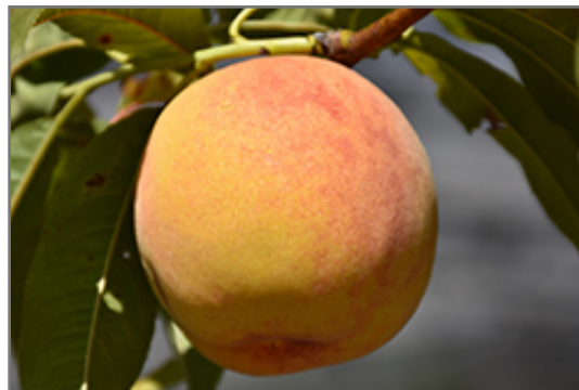
Reliance Peach fruit