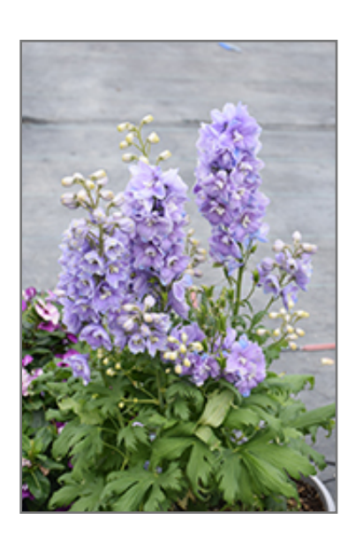
Guardian Lavender Larkspur flowers