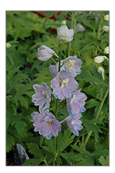
Guardian Lavender Larkspur flowers