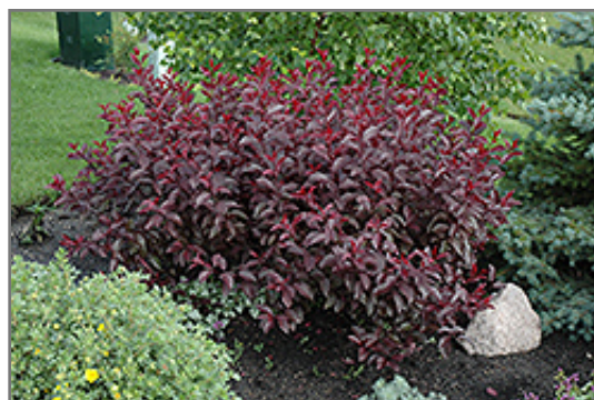
Purpleleaf Sandcherry