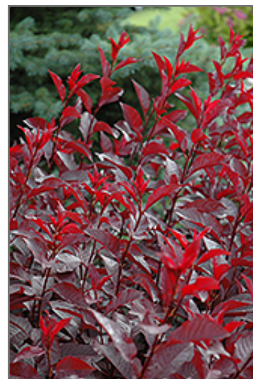
Purpleleaf Sandcherry foliage

This is a relatively low maintenance shrub, and is best pruned in late winter once the threat of extreme cold has passed. It has no significant negative characteristics.