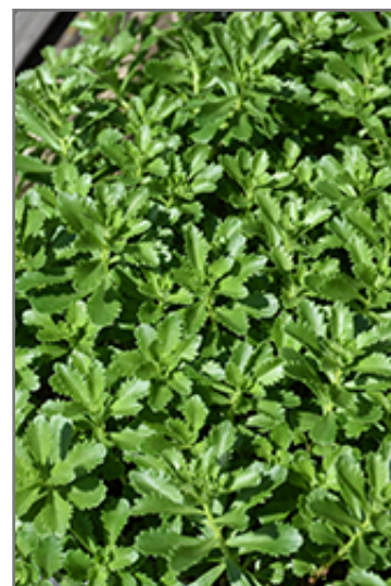
Japanese Stonecrop