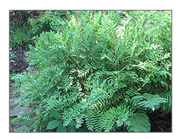
Royal Fern