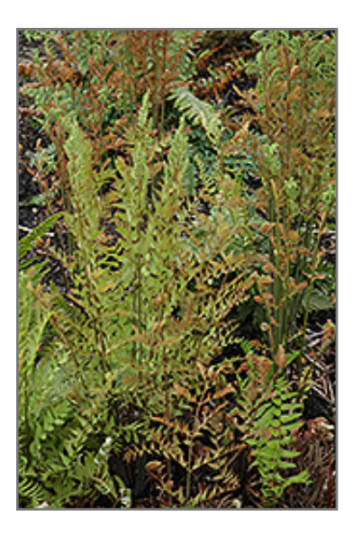
Royal Fern in spring

This plant performs well in both full sun and full shade. It prefers to grow in moist to wet soil, and will even tolerate some standing water. It is not particular as to soil type or pH. It is somewhat tolerant of urban pollution. Consider applying a thick mulch around the root zone over the growing season to conserve soil moisture. This species is not originally from North America. It can be propagated by division.