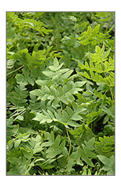
Royal Fern foliage