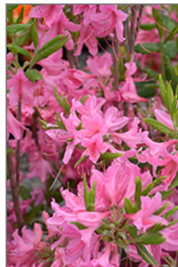
Northern Lights Azalea flowers