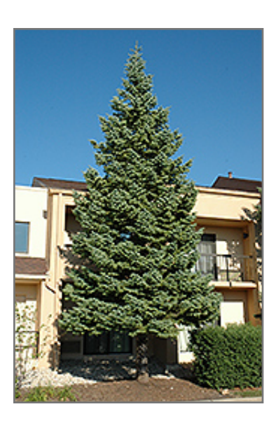
White Fir