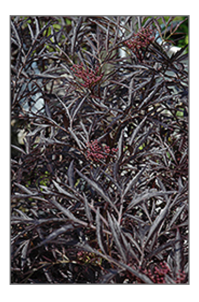
Black Lace Elder flowers

This shrub does best in full sun to partial shade. It is quite adaptable, prefering to grow in average to wet conditions, and will even tolerate some standing water. It is not particular as to soil type or pH. It is highly tolerant of urban pollution and will even thrive in inner city environments. This is a selected variety of a species not originally from North America.