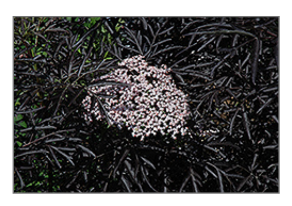
Black Lace Elder flowers

This is a high maintenance shrub that will require regular care and upkeep, and is best pruned in late winter once the threat of extreme cold has passed. It is a good choice for attracting birds to your yard. Gardeners should be aware of the following characteristic(s) that may warrant special consideration;