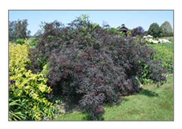
Black Lace Elder