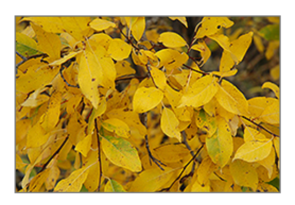
Pussy Willow in fall

This shrub does best in full sun to partial shade. It is quite adaptable, prefering to grow in average to wet conditions, and will even tolerate some standing water. It is not particular as to soil type or pH. It is somewhat tolerant of urban pollution. This species is native to parts of North America.