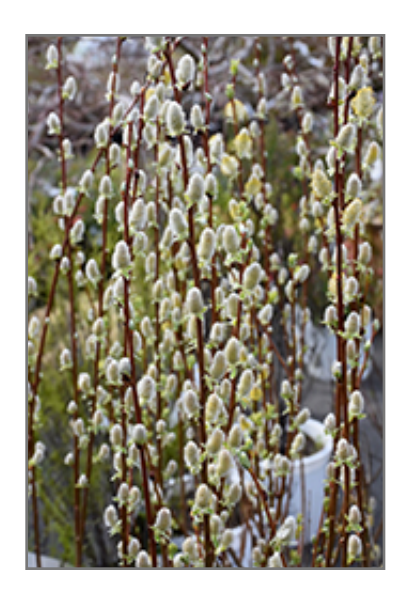
Pussy Willow flowers

Pussy Willow is recommended for the following landscape applications;