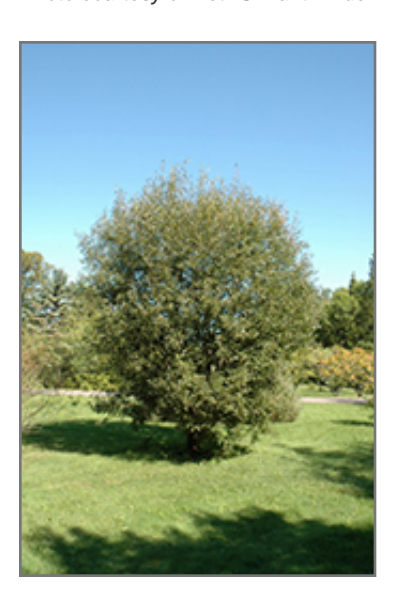
Pussy Willow