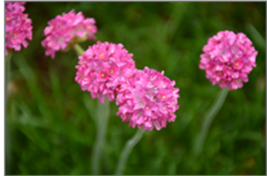
Bloodstone Sea Thrift flowers

Bloodstone Sea Thrift will grow to be only 6 inches tall at maturity extending to 10 inches tall with the flowers, with a spread of 18 inches. Its foliage tends to remain low and dense right to the ground. It grows at a slow rate, and under ideal conditions can be expected to live for approximately 10 years. As an evergreen perennial, this plant will typically keep its form and foliage year-round.