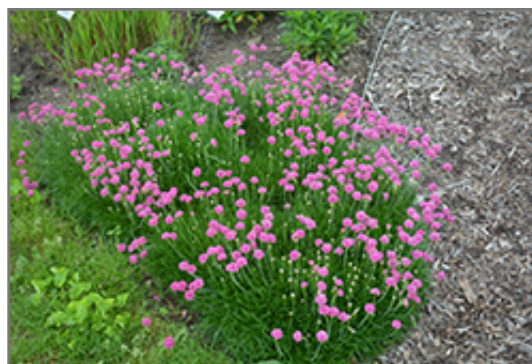
Bloodstone Sea Thrift in bloom