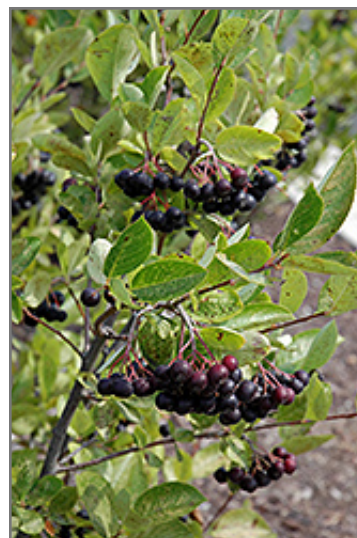
Iroquois Beauty Black Chokeberry fruit