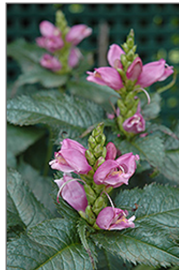
Hot Lips Turtlehead flowers

Hot Lips Turtlehead is recommended for the following landscape applications;