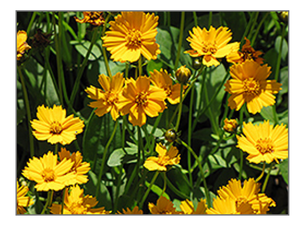
Dwarf Tickseed flowers