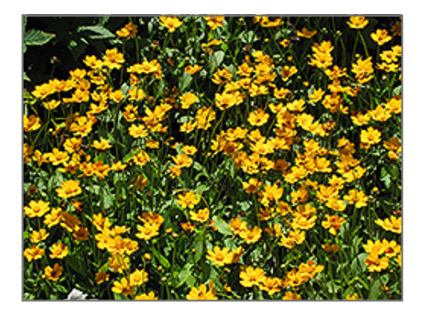
Dwarf Tickseed in bloom