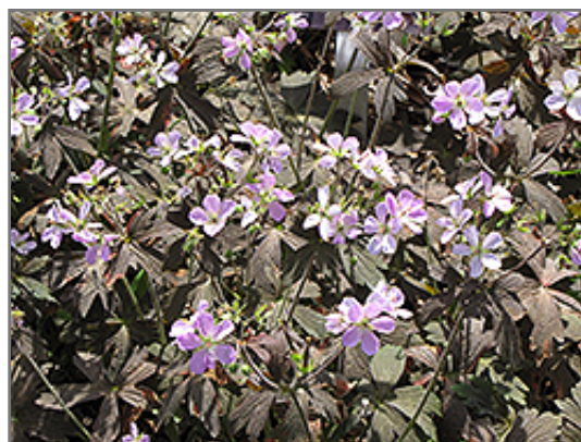
Espresso Cranesbill flowers