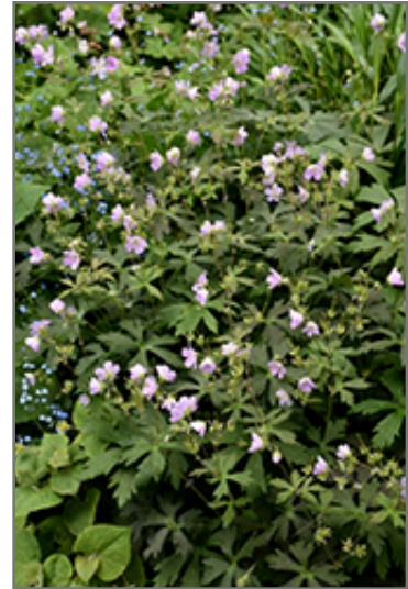
Espresso Cranesbill in bloom

Espresso Cranesbill is a fine choice for the garden, but it is also a good selection for planting in outdoor pots and containers. It is often used as a 'filler' in the 'spiller-thriller-filler' container combination, providing a mass of flowers and foliage against which the thriller plants stand out. Note that when growing plants in outdoor containers and baskets, they may require more frequent waterings than they would in the yard or garden.