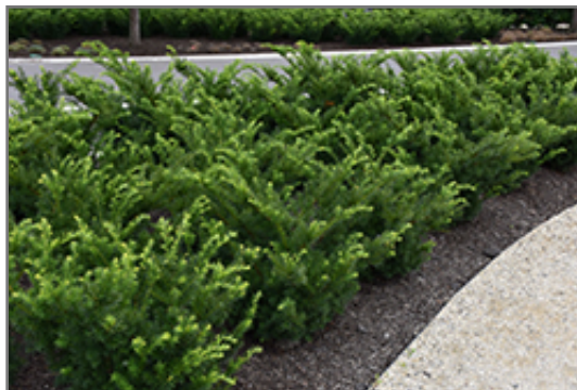
Densiformis Yew