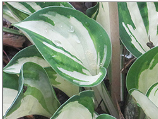
Pandora's Box Hosta foliage