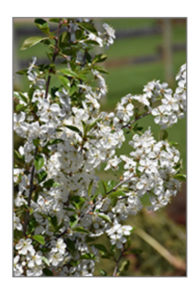
Juliet Cherry flowers