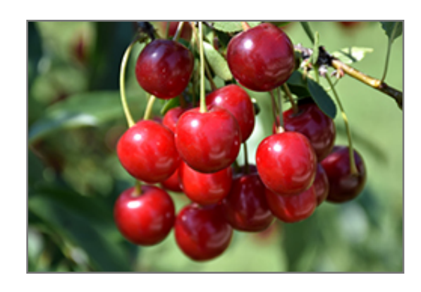
Juliet Cherry fruit

Juliet Cherry features showy clusters of fragrant white flowers along the branches in mid spring. It has green deciduous foliage. The glossy oval leaves turn yellow in fall. The fruits are showy dark red drupes carried in abundance from mid to late summer.