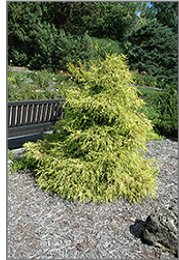
Lemon Thread Falsecypress

Lemon Thread Falsecypress is recommended for the following landscape applications;