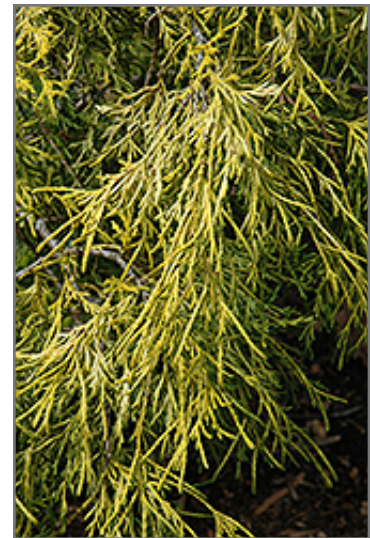
Lemon Thread Falsecypress foliage