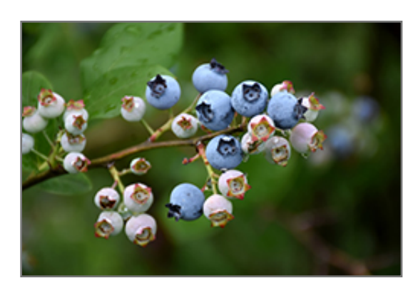
Highbush Blueberry fruit