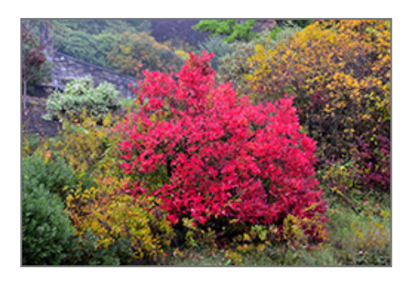
Highbush Blueberry in fall