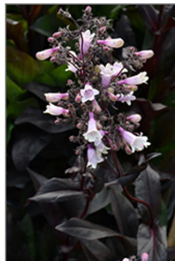
Dark Towers Beard Tongue flowers