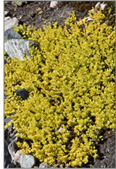
Goldilocks Creeping Jenny

Goldilocks Creeping Jenny is a fine choice for the garden, but it is also a good selection for planting in outdoor containers and hanging baskets. Because of its spreading habit of growth, it is ideally suited for use as a 'spiller' in the 'spiller-thriller-filler' container combination; plant it near the edges where it can spill gracefully over the pot. Note that when growing plants in outdoor containers and baskets, they may require more frequent waterings than they would in the yard or garden.