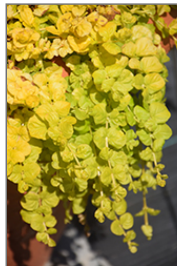
Goldilocks Creeping Jenny foliage