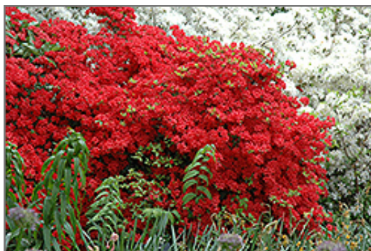
Stewartstonian Azalea in bloom