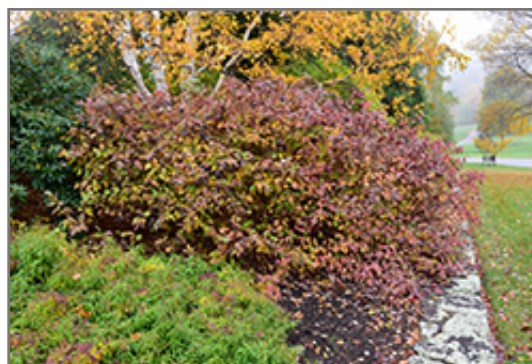
Bailey Red-Twig Dogwood in fall