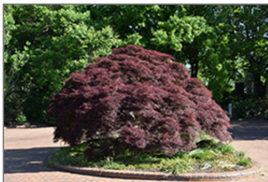
Purple-Leaf Threadleaf Japanese Maple

Purple-Leaf Threadleaf Japanese Maple is recommended for the following landscape applications;