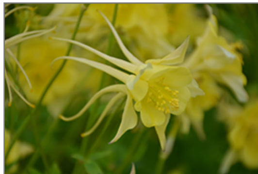
Songbird Goldfinch Columbine flowers