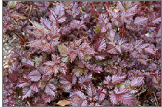
Delft Lace Astilbe foliage

Delft Lace Astilbe is a fine choice for the garden, but it is also a good selection for planting in outdoor pots and containers. With its upright habit of growth, it is best suited for use as a 'thriller' in the 'spiller-thriller-filler' container combination; plant it near the center of the pot, surrounded by smaller plants and those that spill over the edges. Note that when growing plants in outdoor containers and baskets, they may require more frequent waterings than they would in the yard or garden.