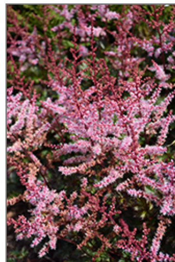
Delft Lace Astilbe flowers

This is a relatively low maintenance plant, and is best cleaned up in early spring before it resumes active growth for the season. It is a good choice for attracting butterflies to your yard, but is not particularly attractive to deer who tend to leave it alone in favor of tastier treats. It has no significant negative characteristics.