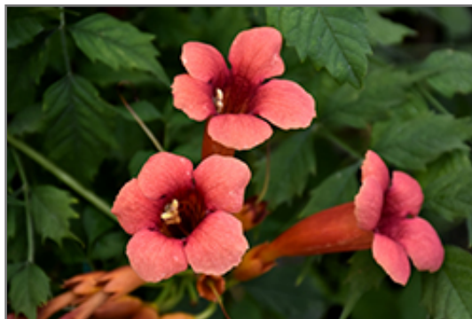
Flamenco Trumpetvine flowers

This is a high maintenance woody vine that will require regular care and upkeep, and can be pruned at anytime. It is a good choice for attracting birds and hummingbirds to your yard, but is not particularly attractive to deer who tend to leave it alone in favor of tastier treats. Gardeners should be aware of the following characteristic(s) that may warrant special consideration;