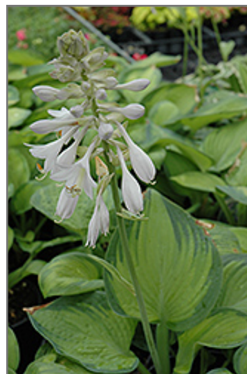
Paradigm Hosta flowers