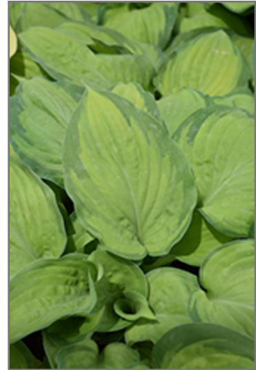
Paradigm Hosta foliage

* This is a 'special order' plant - contact store for details