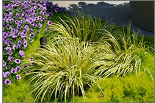
Grassy-Leaved Sweet Flag

Grassy-Leaved Sweet Flag is recommended for the following landscape applications;