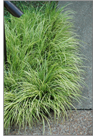
Grassy-Leaved Sweet Flag

Grassy-Leaved Sweet Flag is a fine choice for the garden, but it is also a good selection for planting in outdoor pots and containers. It is often used as a 'filler' in the 'spiller-thriller-filler' container combination, providing a canvas of foliage against which the larger thriller plants stand out. Note that when growing plants in outdoor containers and baskets, they may require more frequent waterings than they would in the yard or garden.