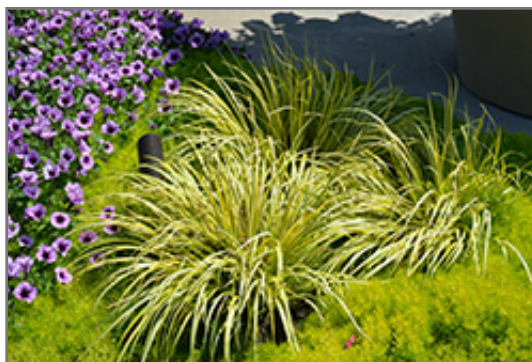
Grassy-Leaved Sweet Flag

Grassy-Leaved Sweet Flag is recommended for the following landscape applications;