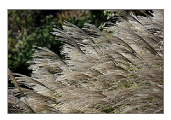
Gracillimus Maiden Grass fruit