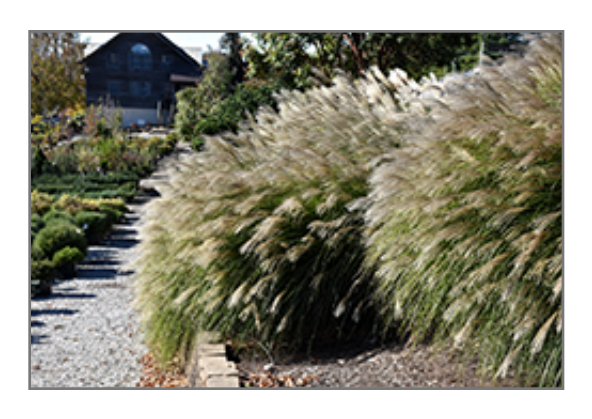
Gracillimus Maiden Grass

This plant will require occasional maintenance and upkeep, and is best cleaned up in early spring before it resumes active growth for the season. It has no significant negative characteristics.