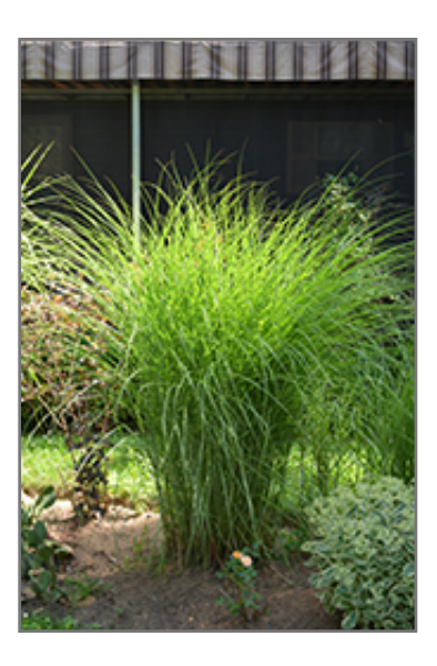
Gracillimus Maiden Grass

Gracillimus Maiden Grass will grow to be about 4 feet tall at maturity extending to 6 feet tall with the flowers, with a spread of 4 feet. It tends to be leggy, with a typical clearance of 1 foot from the ground, and should be underplanted with lower-growing perennials. It grows at a medium rate, and under ideal conditions can be expected to live for approximately 20 years. As an herbaceous perennial, this plant will usually die back to the crown each winter, and will regrow from the base each spring. Be careful not to disturb the crown in late winter when it may not be readily seen!