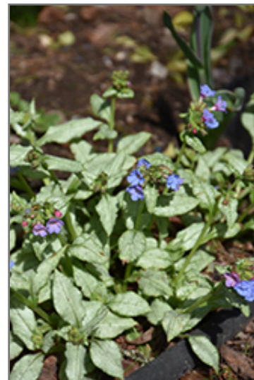
Moonshine Lungwort in bloom

This is a relatively low maintenance plant, and should be cut back in late fall in preparation for winter. It is a good choice for attracting hummingbirds to your yard, but is not particularly attractive to deer who tend to leave it alone in favor of tastier treats. It has no significant negative characteristics.