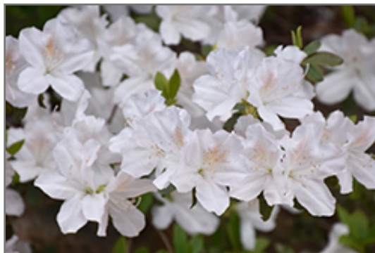
Delaware Valley White Azalea flowers