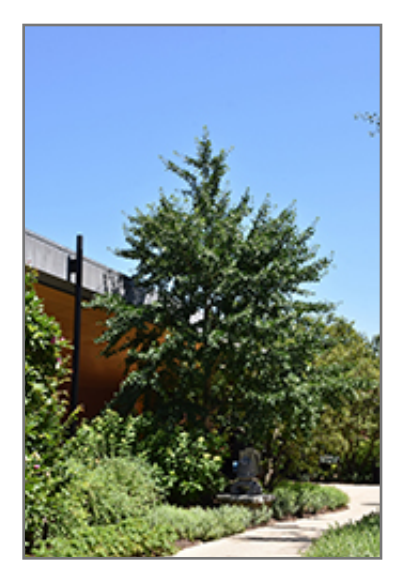
Autumn Gold Ginkgo