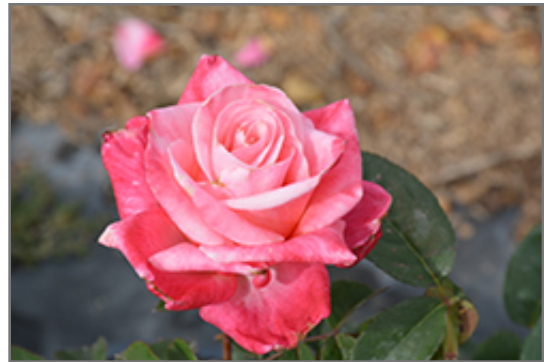
First Prize Rose flowers