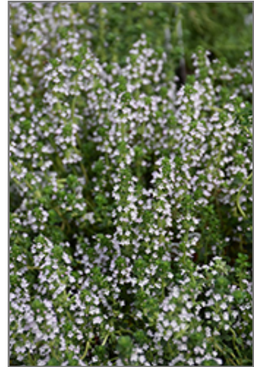
Doone Valley Thyme flowers

This plant will require occasional maintenance and upkeep, and is best cleaned up in early spring before it resumes active growth for the season. Deer don't particularly care for this plant and will usually leave it alone in favor of tastier treats. Gardeners should be aware of the following characteristic(s) that may warrant special consideration;