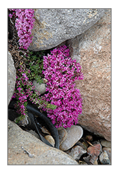
Pink Chintz Creeping Thyme in bloom

This plant should only be grown in full sunlight. It prefers to grow in average to dry locations, and dislikes excessive moisture. It is considered to be drought-tolerant, and thus makes an ideal choice for a low-water garden or xeriscape application. It is not particular as to soil type or pH. It is highly tolerant of urban pollution and will even thrive in inner city environments. Consider covering it with a thick layer of mulch in winter to protect it in exposed locations or colder microclimates. This is a selected variety of a species not originally from North America. It can be propagated by division; however, as a cultivated variety, be aware that it may be subject to certain restrictions or prohibitions on propagation.