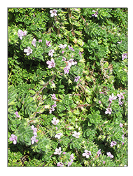
Pink Chintz Creeping Thyme flowers