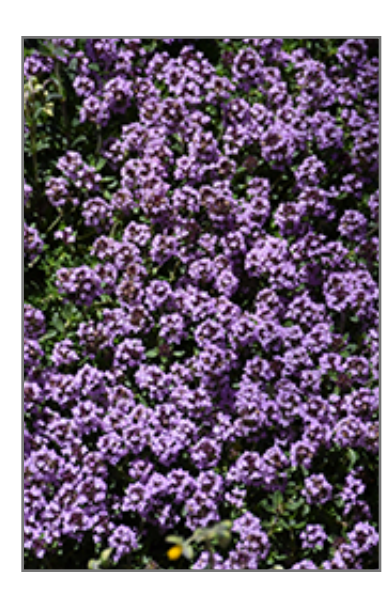
Pink Chintz Creeping Thyme flowers